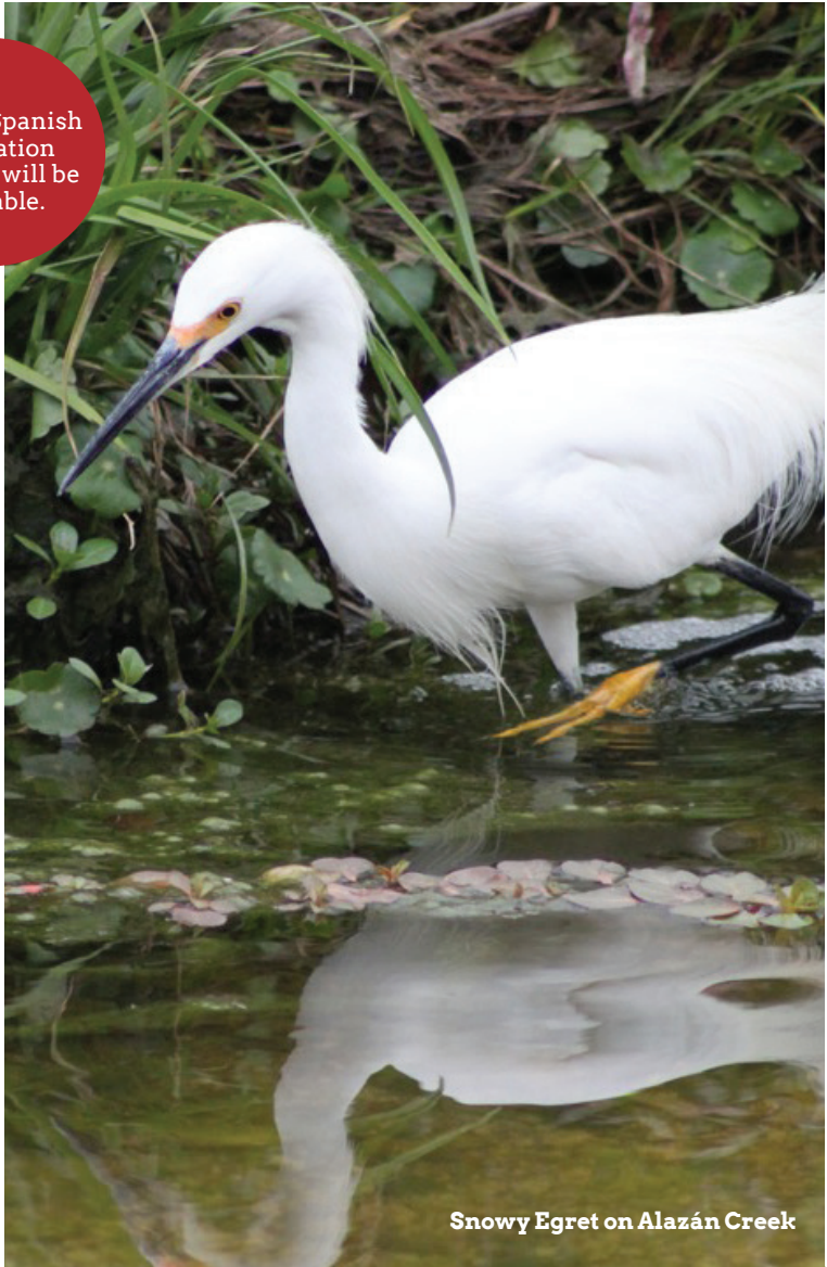
Snowy Egret on Alazán Creek

The Westside Creeks are located entirely within the City of San Antonio's urban core in Bexar County, Texas, extending west and northwest of downtown with a segment extending south of downtown to the San Antonio River. The project limits are based upon the 1954 federal San Antonio Channel Improvement Project (SACIP) that addressed flooding on San Pedro, Apache, Alazán, and Martínez Creeks. The project will reconstruct the creeks into more natural channels, while maintaining the present level of flood mitigation protection. Using ecosystem restoration and recreation benefits as a foundation, the project will provide significant environmental justice and community benefits, such as improving environmental and water quality conditions in a densely populated urban area.